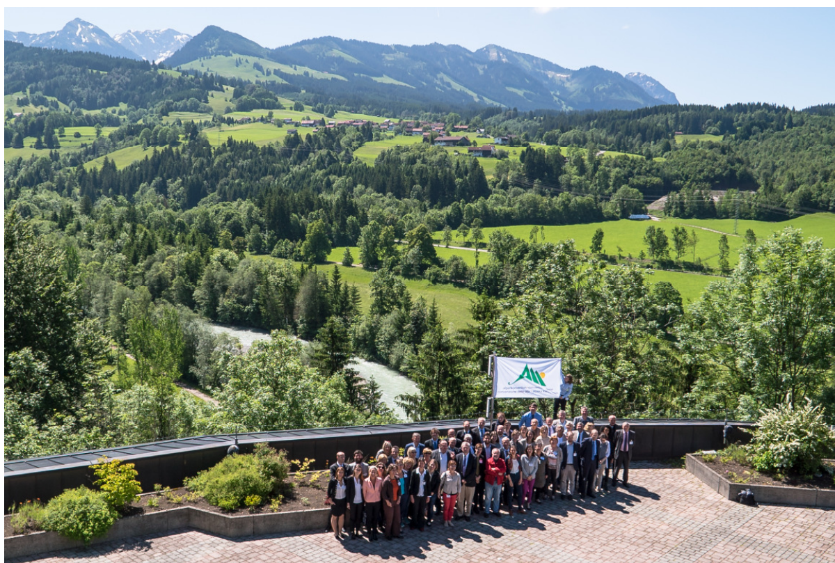
Figure 1: The 61 st Permanent Committee meeting in Sonthofen.

The Permanent Secretariat worked closely with the German presidency in organising the 58 th Permanent Committee meeting in Bolzano/Bozen (IT), 12-13 March 2015, the 59 th Permanent Committee meeting in Berchtesgaden (DE), 15-16 October 2015 the 60 th Permanent Committee meeting in Innsbruck (AT), 25-26 February 2016, the 61 st Permanent Committee meeting in Sonthofen (DE), 9-10 June 2016 and the 62 nd Permanent Committee meeting in Grassau (DE), 11-12 October 2016. The Permanent Secretariat supported the Presidency in organising these meetings either as by obtaining the “Going green event” or “Green event” labels available at regional level or by applying the “Recommendations for the Sustainable Organization of Meetings and Events of the Alpine Convention”, which is a novelty in the organisational practice.