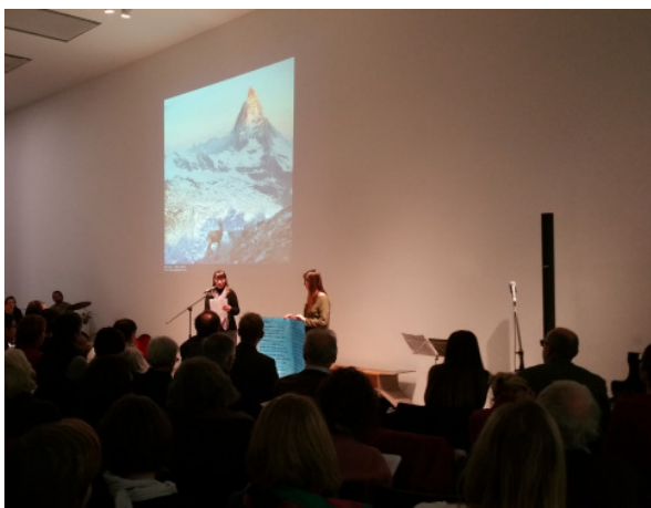
Figure 2: the audience at the “Reading Mountains” event in Bolzano/Bozen.