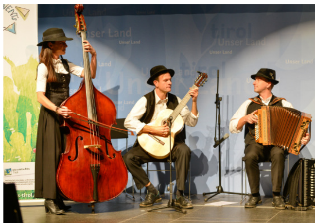
Figure 3: the “Reading Mountains” event in Innsbruck.