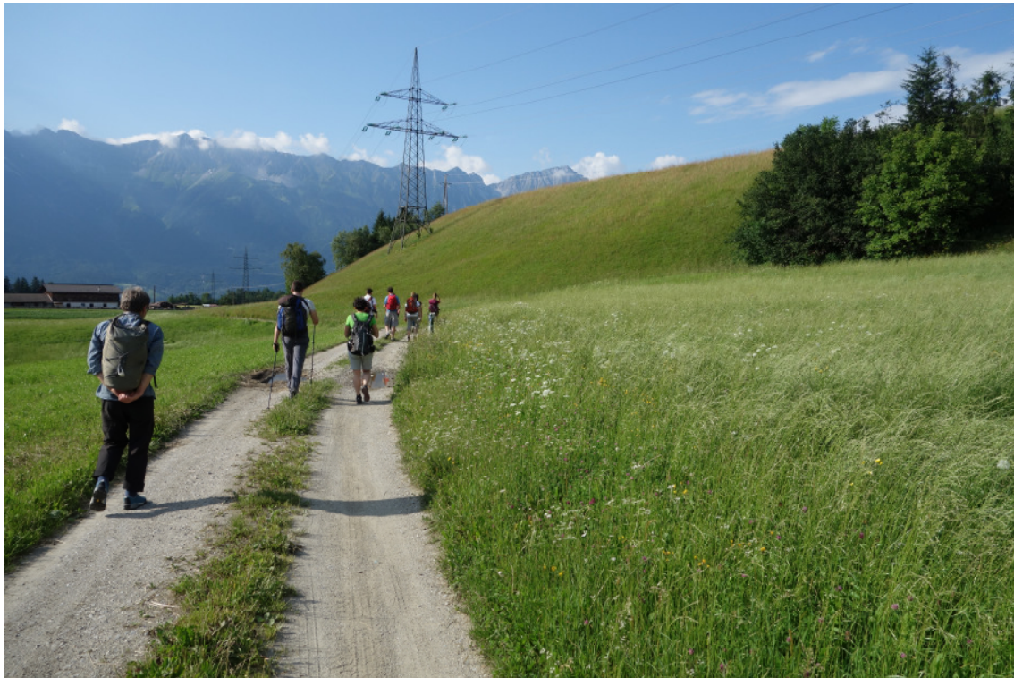
Figure 4: the We Are Alps 2016 tour.

economic development as the basis for a good quality life in the Alps. As always in the We are Alps tour, the group travelled exclusively by sustainable means of transport. During the tour, participants had the opportunity to meet the actors of flagship projects contributing to innovative approaches on topics such as water and forest management, spatial planning, transport, tourism, farming, energy production and savings and many more. The second day of the tour was the opportunity for the participants to meet the German State Secretary Schwarzelühr-Sutter and the Bavarian minister Scharf at the visit to the Sylvensteinspeicher Dam and to see the jubilee Alpine Convention stamp.